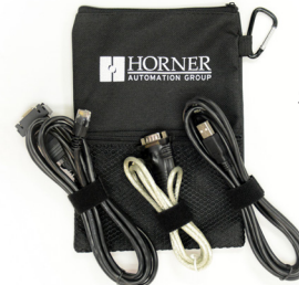
HE-XCK Programming <u>Cable Kit Includes</u> USB to Mini USB Adapter Cable USB to RS-232 Serial Adapter Cable RS-232 Serial to RJ45 Ethernet Adapter Cable